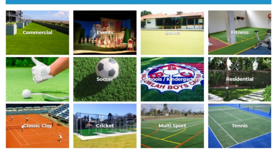
Some Reference Projects