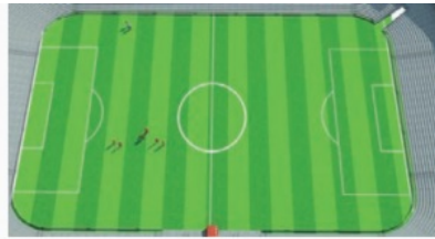
7. The whole picture of the stadium