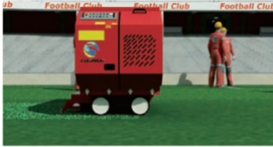
6. Installing the infill granule