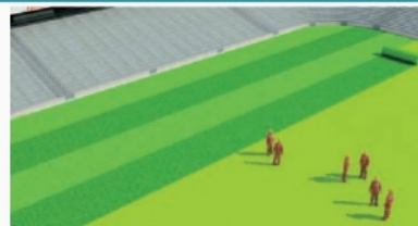
3. Artificial turf laying process