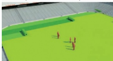
2. Laying of artificial turf