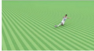
8. Site put into use