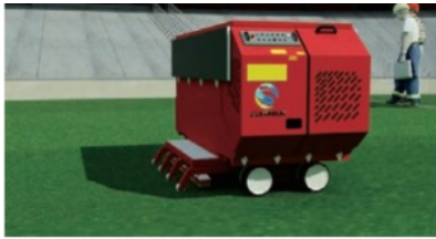
5. Infill the sand