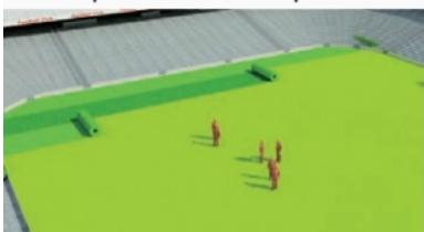
2. Laying of artificial turf