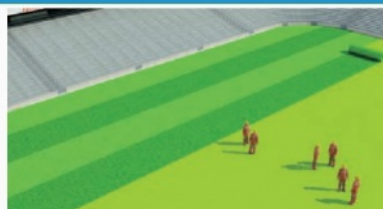
3. Artificial turf laying process