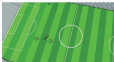
4. Artificial turf laid