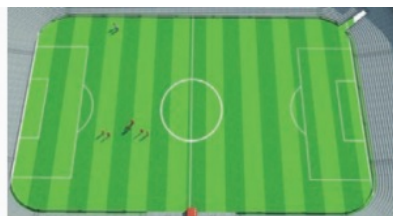
7. The whole picture of the stadium