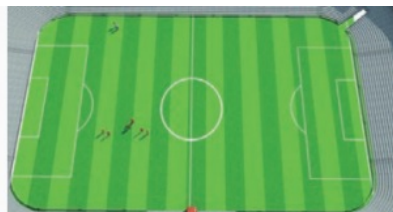
7. The whole picture of the stadium