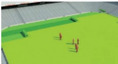
2. Laying of artificial turf