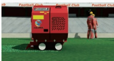
6. Installing the infill granule