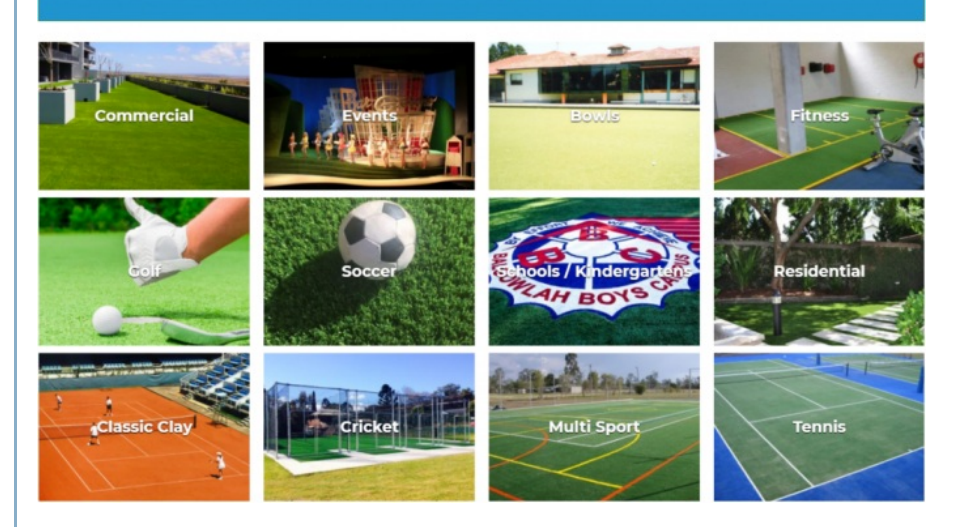
Some reference projects