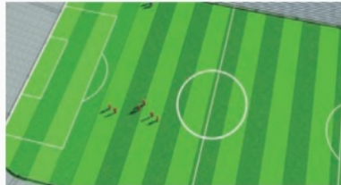
4. Artificial turf laid