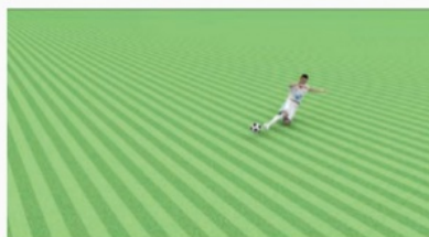
8. Site put into use