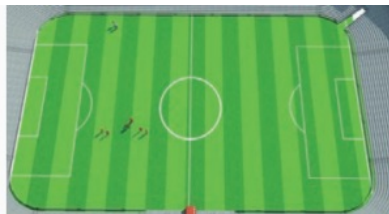
7. The whole picture of the stadium