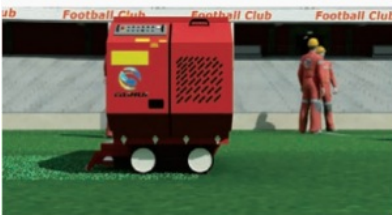
6. Installing the infill granule