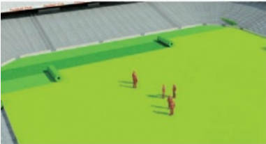
2. Laying of artificial turf