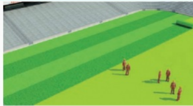
3. Artificial turf laying process