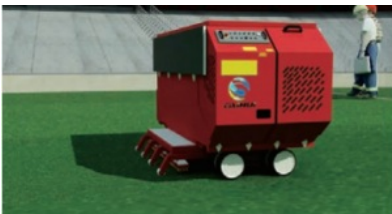
5. Infill the sand